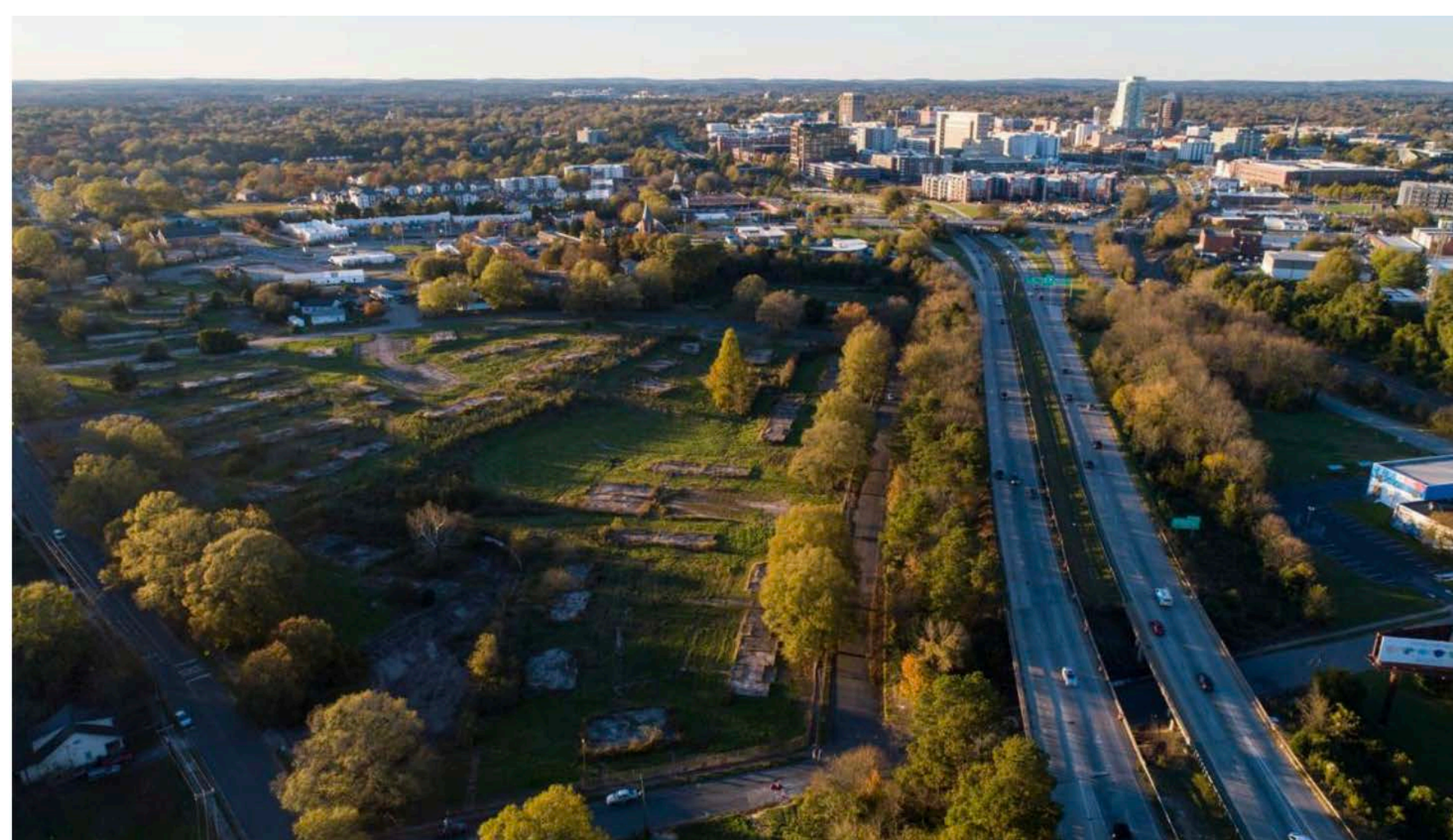
In the 1960s and early 70s, the Hayti neighborhood was upended for the construction of the Durham Freeway, pictured here on November 16, 2020 leading into downtown.