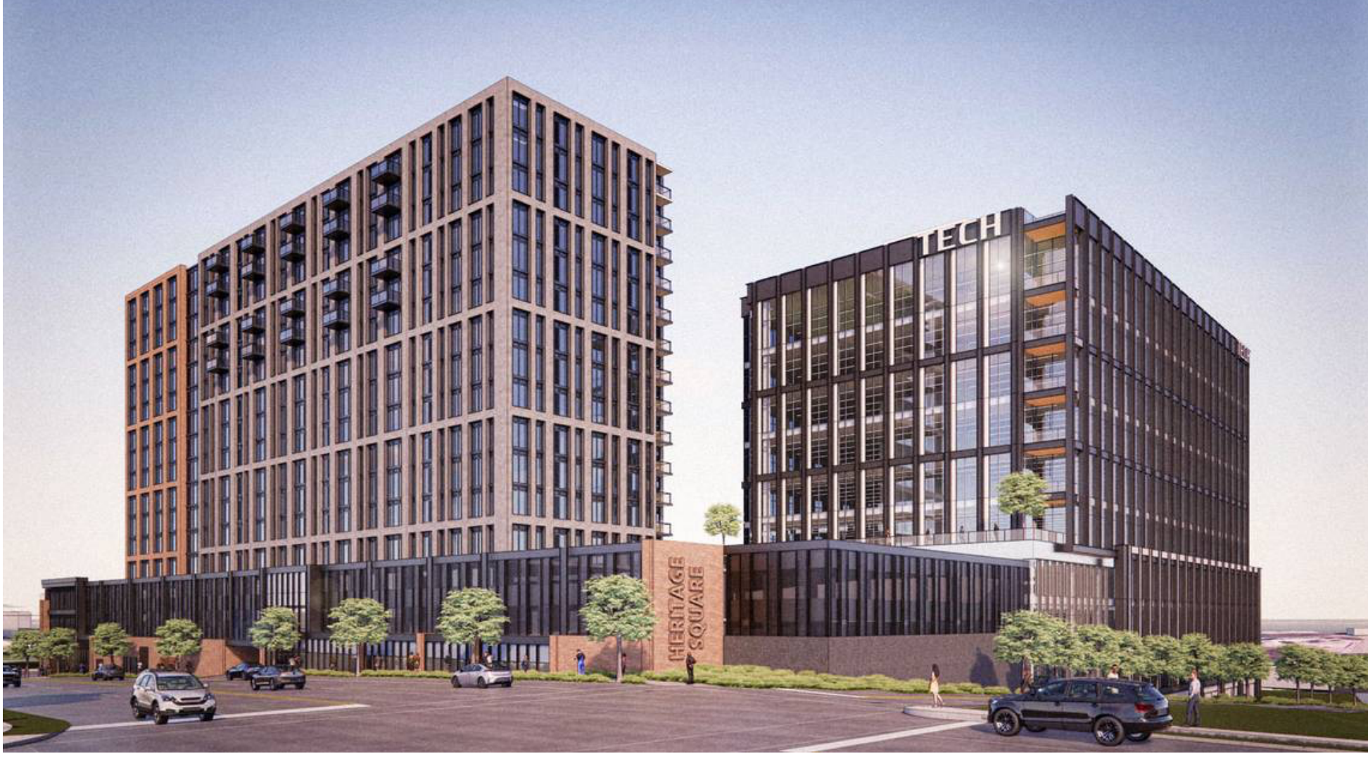
The first phase of Heritage Square, located along Highway 147 and Fayetteville Street in Durham, will include a 13-story residential building and an 11-story office building. Sterling Bay

Designs for the start of an ambitious redevelopment featuring apartments, restaurants and offices along the Durham Freeway will be submitted for approval this month.